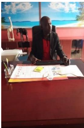
Analyzing the Results

If they could be merited in their former schools they could be among the tops unlike before when they were at the bottom. This made me to realize that consistent encouragement to learners irrespective of their limitation, coupled with a revelation of what they are capable of if they do their best has led me to believe that if accorded psychological security and motivated appropriately, most learners commit themselves to realizing their full potential. Therefore, if the two aspects are properly executed, most learners' output would be tremendous.