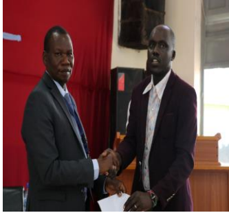
Handing my written submission to the PRESIDENTIAL WORKING PARTY ON EDUCATION (CBC) REFORMS TASKFORCE ON BEHALF OF ADC Schools of Vihiga County at Moi Girls National School - Vokoli. On 11/11/2022

For everyone to be on board including parents, I had to introduce academic clinic days -one academic clinic day once a term where subject-teachers, class teachers, parents and the learners had informative conversation and discussion. External speakers were invited to take parents through the roles of parents in education. This made teachers to receive maximum support from the parents and guardians. All the programs of the school ran smoothly due to that unwavering support from the parents.